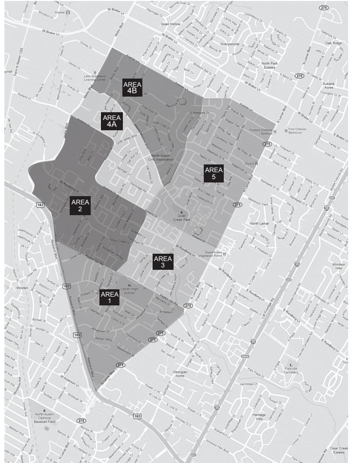
Newsletter Walkers distribution area in need.

AREA 5: Barnhill + 1442-1469 S Meadows (40), Bird Creek(66) + Fieldwood(78) = (144), N Meadows Dr (146) Quail Blvd (6)