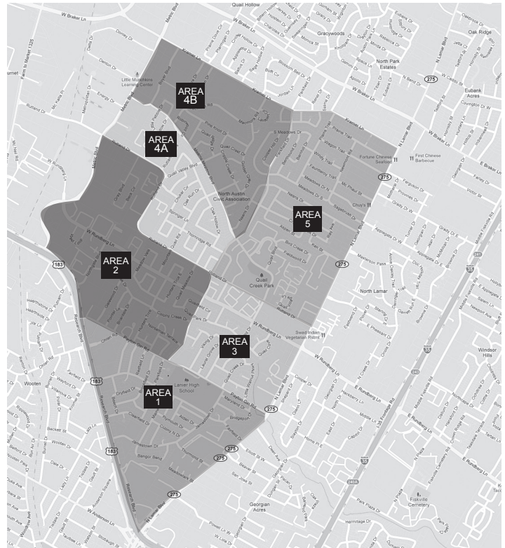
Newsletter Walkers distribution area in need.

AREA 1: no walker needed AREA 2: Briardale (26), Hunters Trace (40/Payton Gin-Rndbrg), Rundberg Ln. (12/W of Parkfield), Rutland Dr. (61/W of Parkfield), Tronewood (5) AREA 3 Grouse Meadow + 1201-1205 Rutland (58) 1103-1127 Rundberg + 9302 Collinfield (28) AREA 4A – no walker needed AREA 4B Lambert Cir. (31), Pine Knoll Dr. (55) AREA 5 Barnhill + 1442-1469 S. Meadows (40), Bird Creek (66), Fieldwood (78), N Meadows Dr. (146), Quail Blvd. (6)