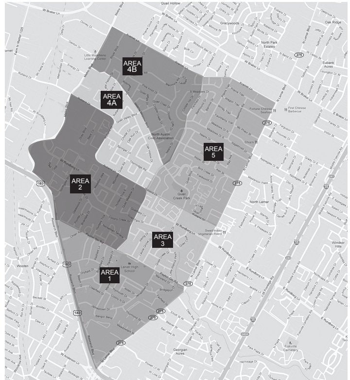
Newsletter Walkers distribution areas.

AREA 5: Barnhill + 1442-1469 S Meadows (40), Bird Creek (66), Fieldwood (78), N Meadows Dr (153), Quail Blvd (6)