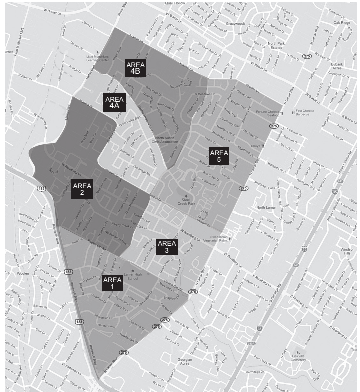
Newsletter Walkers distribution area in need.

AREA 5: Barnhill(29) + 1442-1469 S. Meadows(18), Bird Creek(66) + Fieldwood(78), Meadgreen Dr.(E. of Parkfld) + Meadgreen Ct. + Humington Dr.(40), N. Meadows(153), Quail Blvd.(6)